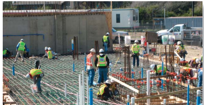
The Headquarters Building has supported >500 construction jobs.

Tourism and fishing are vital to our economy, but we all know that our children are the key to providing a future that thrives both economically and environmentally. The Reserve is committed to helping the leaders of tomorrow understand how our coastal resources work and how they affect the way we live. The K-12 education programs offered at the Reserve provide children with the skills they will need to make good decisions that sustain our coastal resources well into the future. These coastal resources are key drivers to both our current and future economy. The Mission-Aransas Reserve is proud to play a part in supporting coastaleconomies. Read on to learn more about our programs and how they support local communities.