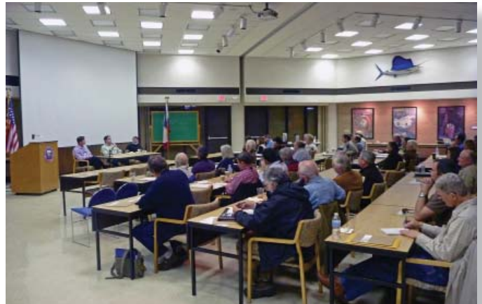
Participants engage blue crab experts during a panel discussion.

Attendees were fond of the expert discussion panel and found that it was "... effective in tying earlier talks' subjects and branching out into other specific subjects." Don't worry if you missed it - presentations and video recordings from the event can be viewed through our website (see below for link).