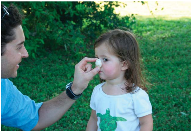
A team member tries a shell on for size at the Coastal Bend Nature Challenge opening event.

Statewide organizations interested in re-connecting children with nature have come together to form the Texas Partnership for Children in Nature. The Texas Parks and Wildlife Department, one of our Reserve partners, is a leading member of the partnership. Mission-Aransas educators recently attended a conference hosted by the partnership to learn about their new strategic plan, which may be accessed at: www.texaschildreninnature.org . Among other goals, the plan calls for increased outdoor learning experiences, access to natural areas for all people, and outdoor physical activity opportunities.