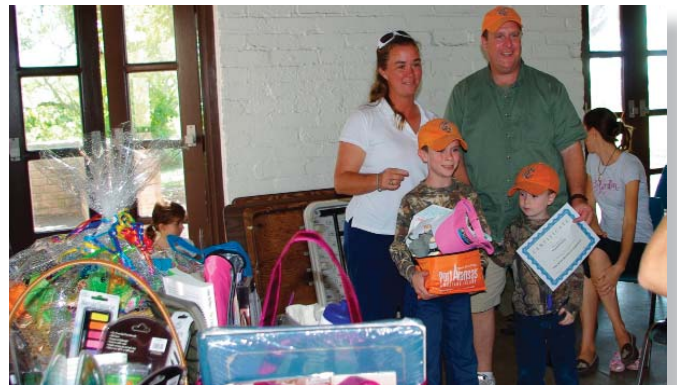
Grand prize winners, "Team White," accept their prize at the Coastal Bend Nature Challenge closing ceremonies.